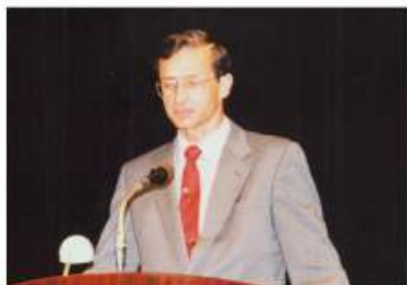
Richard R. Schrock