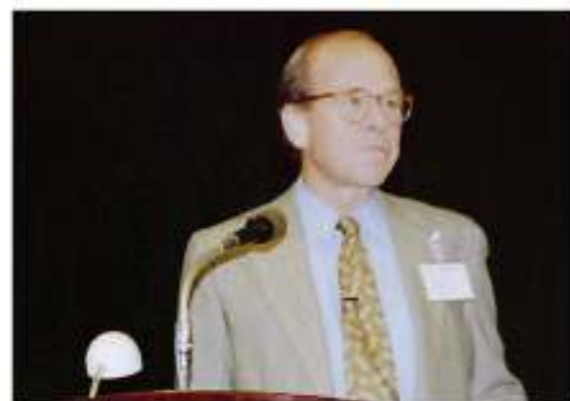
K. Barry Sharpless