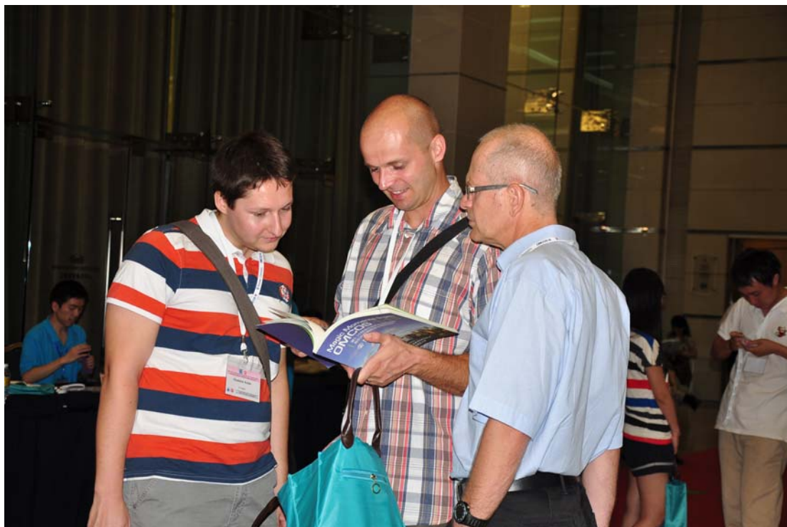
Reading the “Magic Moments from OMCOS 1-15” after registration