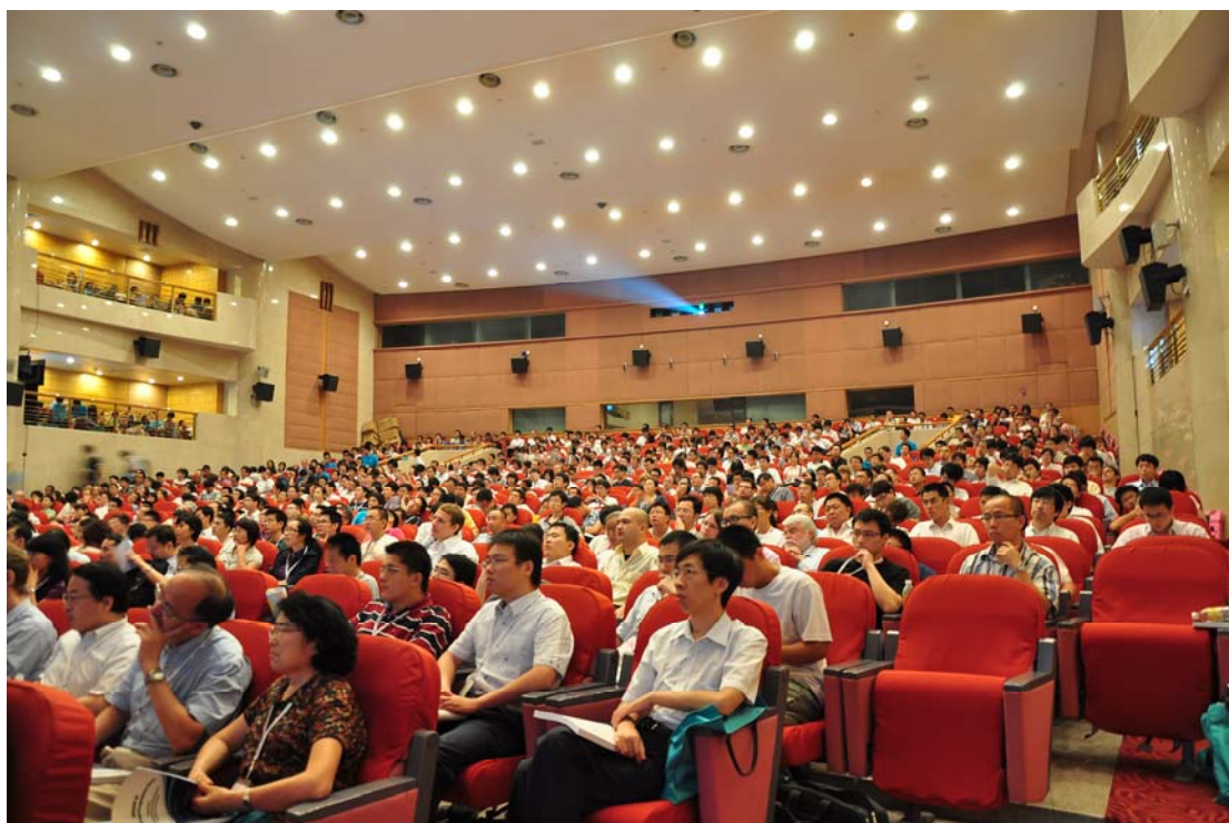
An exciting attendance to the lectures

In addition to these well-received lectures, this symposium also organized extensive poster sessions comprising 507 posters of remarkably high quality. On the basis of assessment by the distinguished international committees, 20 posters were awarded with the OMCOS-16 Poster Prizes, sponsored by Henkel, Wiley, IUPAC, Thieme, the Royal Society of Chemistry, and Elsevier.