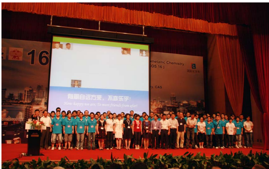
The closing ceremony with sincere thanks to the large number of faculty and students whose help made OMCOS 16 a successful event.